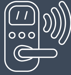
Entry phone system

The accommodation offers a high quality specification including the following: