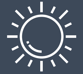
Great natural light