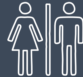
Shared WC facilities